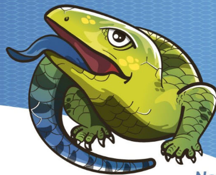
Naruta Blue tongue lizard